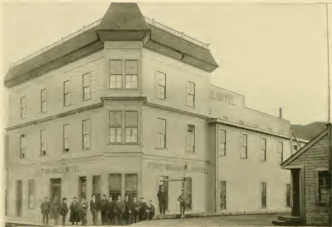
Fort Wrangel Hotel.